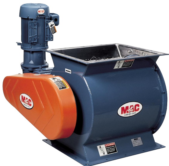
FS shown in customer requested specialty color

The MAC fabricated square (FS) airlock is equipped with flexible, wiper blade rotors. These extra flexible blades provide superior handling for stringy or fibrous products.